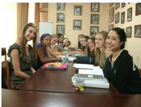
Russian Language Class!

I have learned so much with this program: in language, dance, and about the world in general. I got filled with a sense of pride when I was able to communicate successfully with a native and local Russian speaker. I have seen immense growth in myself through the weeks with NSLI-Y. My passion for learning languages has only increased, and my curiosity about cultures has also grown. I have seen personal improvement in my dancing because of the talented teachers I was given here. This program inspired me to think of all the possibilities that this has opened up, like traveling to more foreign countries, pursuing a career in dance, and continuing to expand my language skills. I have also grown to realize that I love Russia and everything that is involved with it. Six weeks in Moscow is not enough for me. My love for this culture and its people has proved to have had a prominent impact on my life. I am hoping to come back to Russia and visit this amazing country again. With that said, being immersed in the Russian culture has impacted my life in a way that I will forever remember and look back on with nothing but fond memories and a smile on my face.