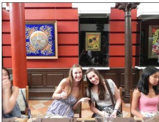
Dinner before art class!